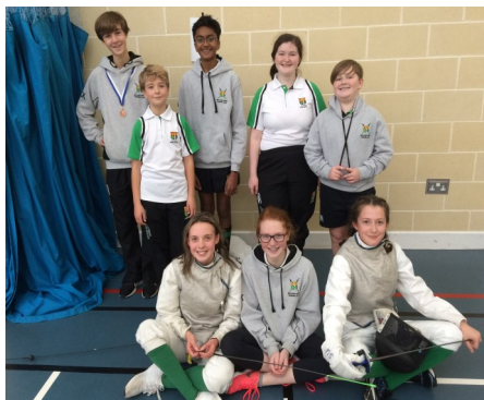
SU fencers competing at NIJFS Round 1 (minus Charlie Beimers)

Round 2 takes place on Sunday 9 December 2018 in RBAI in Belfast.