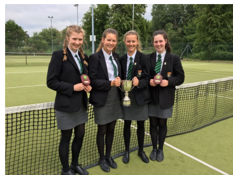
Junior Tennis Team