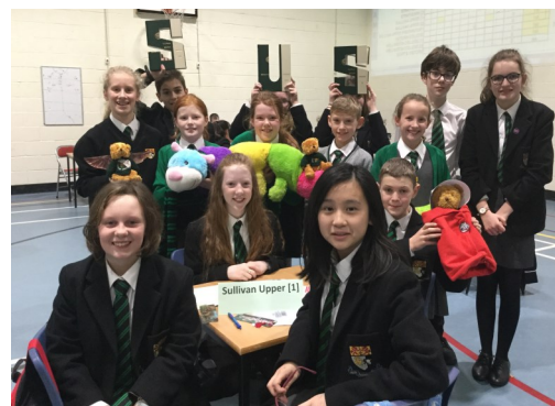
PHOTO: Yr 8, 9 & Prep teams