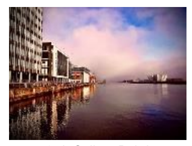
3rd Callum Baird