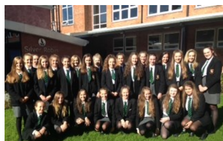
Junior Honours - Sport