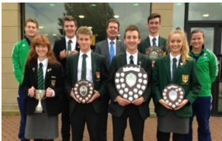
Contribution to Senior Sports