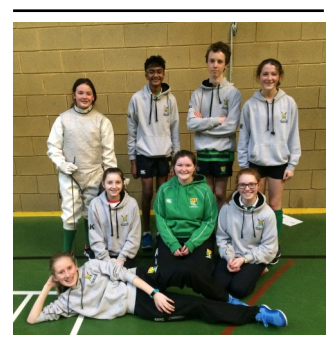
SU fencers at NIJFS Round 3